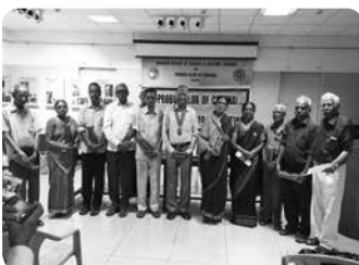
Probian volunteers of Elders Day function