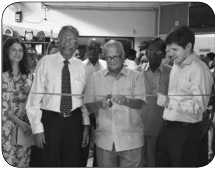
Exhibition Inaugurated by R.V.Rajan