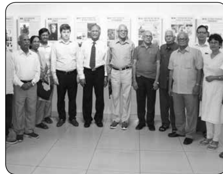
One group of Probus Visitors