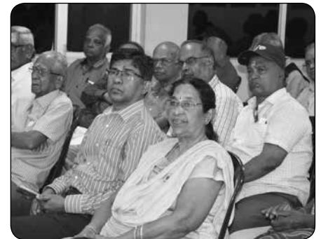
Another group of Probus visitors