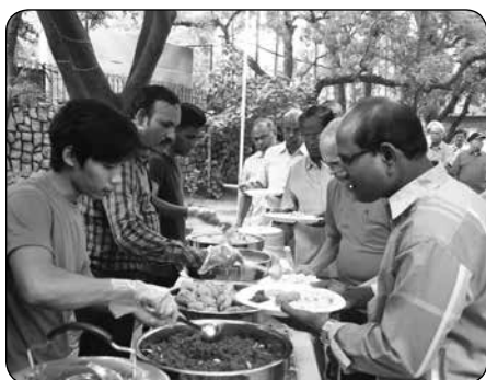
Function ended with High-Tea