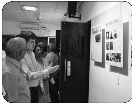
RCSC Director explains