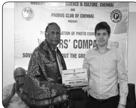
President felicitated and given memento