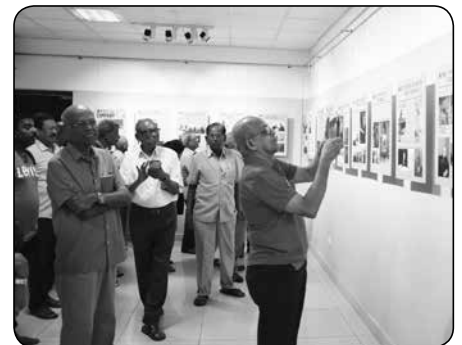
Probus members enjoying the photo exhibition